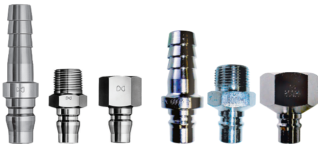
20 / 30 / 40 SERIES