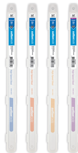
10 Pack Case