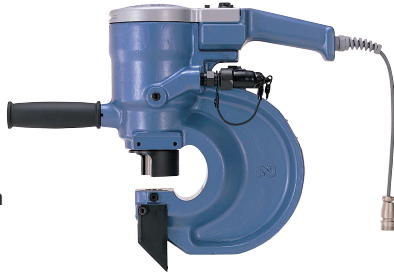
Requires Selfer Ace Pump HPD-05 to operate