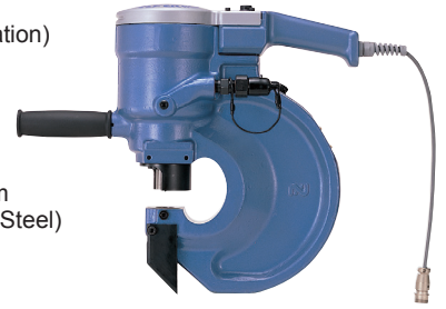
Requires Selfer Ace Pump HPD-05 to operate