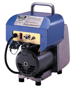
Required to operate Selfer Ace Punches