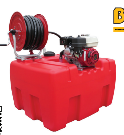
HIGH PRESSURE FIRE TANKS & SYSTEMS

Full range of 1" to 3" High Pressure Fire Pumps available with petrol and diesel options for the entire range.