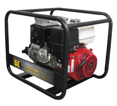
WATER TRANSFER & TRASH PUMPS

Full range of 1" to 6" Wanter Transfer and trash pumps available with petrol and diesel options for the entire range.