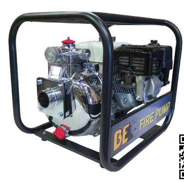
HIGH PRESSURE FIRE PUMPS

Full range of 1" to 6" Wanter Transfer and trash pumps available with petrol and diesel options for the entire range.