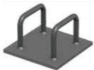
D Stirrup Connection Plate without Ferrule