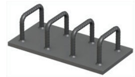
D Stirrup 4 Bars