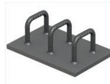
D Stirrup 3 Bars